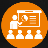
Training and Education